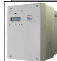
FM1803-2 model 3 blade design with MPC1 controller inset