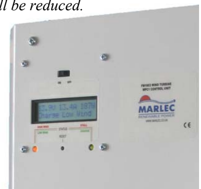
MPC1 Electronic controller with digital display is included.